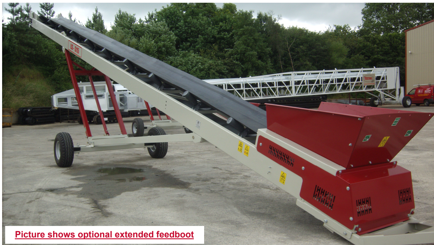
Picture shows optional extended feedboot

40ft (12m), 50ft (15m), 60ft (18m) & 80ft (24m)